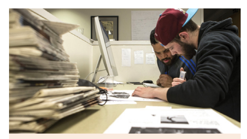
Journalism students at work, Klein College of Media and Communications.

Recognizing the key role that research and development may play in developing digital tools for journalism innovation, Wyncote endowed a chair at <u>Temple University's Klein College of Media and Communications</u> to build digital depth and expertise for the Philadelphia media ecosystem and beyond. Temple was able to attract an internationally-respected leader in the field who had led digital innovation at the Guardian and the New York Times . Having developed the tool that made possible the international collaboration uncovering the Panama Papers, he is working closely with the Lenfest Institute in addition to his faculty responsibilities at Temple.