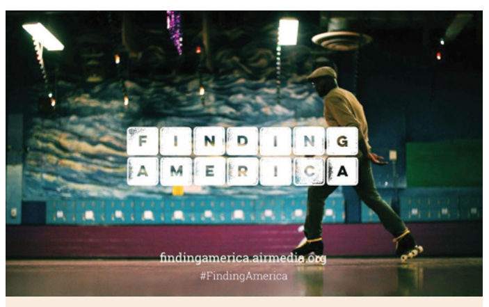
Localore: Finding America.

• <u>Localore: Finding America</u> is a continuing project of the Association of Independents in Radio (AIR), that matches independent producers with local public radio and television stations to create rich, diverse