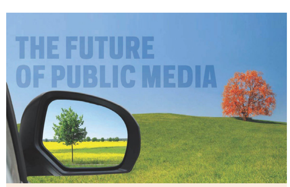
For the 50th anniversary of the Public Broadcasting Act, Current offered insightful essays on the field's future.