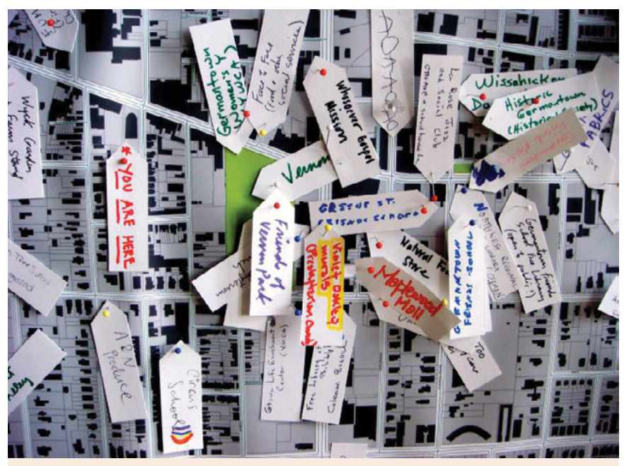
Community input for a Philadelphia neighborhood planning process.

As a place-based foundation with both national and regional interests, Wyncote has supported local and regional digital and legacy media that enrich topical coverage and also demonstrate forward thinking practices in journalism.