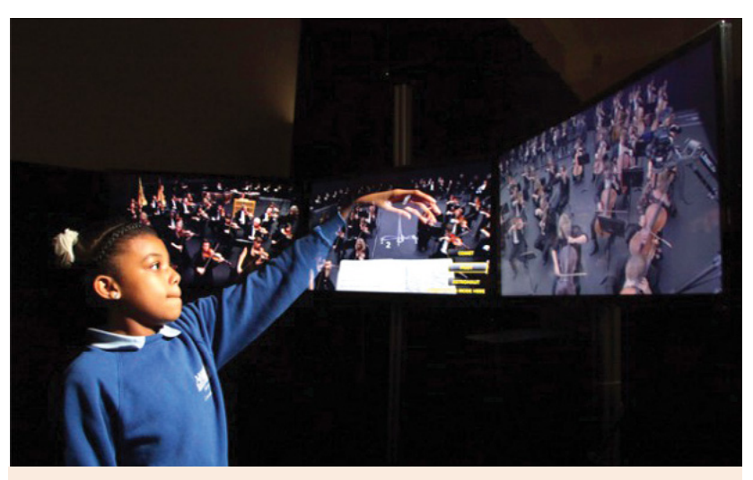
A student conducts the Philharmonia's digital orchestra in this featured project from Like, Link, Share.