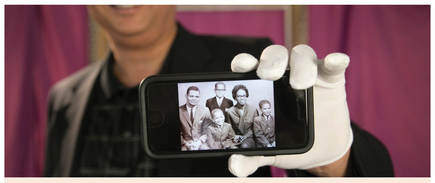
Sharing photos and stories.